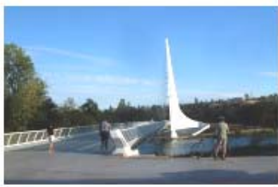
Sun Dial Bridge in Redding

A favorite evening activity is to walk the river paths and cross the lighted glass Sun Dial Bridge over the Sacramento River. The Bridge connects the arboretum to the Turtle Bay museum. The river paths run for 6 miles with three pedestrian bridges across the Sacramento River.