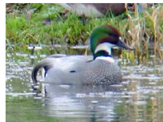
Our lake, winter home to the Falcated Duck

The duck is spending his second season with us.