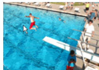
Redding Aquatic Center

The City of Redding also has a wonderful aquatic center with swimming pool and children's water features. Just a few feet from the swimming pool is a great skate board facility. Both are located within Caldwell Park a short 5 minute drive from Premier RV Resorts.